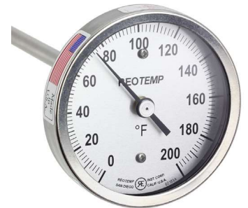
C00416 - Heavy Duty Thermometer

5. Manage: Check temperature, it should get hot relatively quickly, should be over 115 F within about 5 days and run from 130 to 160 F. Pile will drop as carcasses start to deteriorate, reshape the pile for rain runoff if settled in the middle. Pile is ready for turning/mixing when temp drops to 110 F to complete the process. This 18 inch steel thermometer may be used to manage the process: